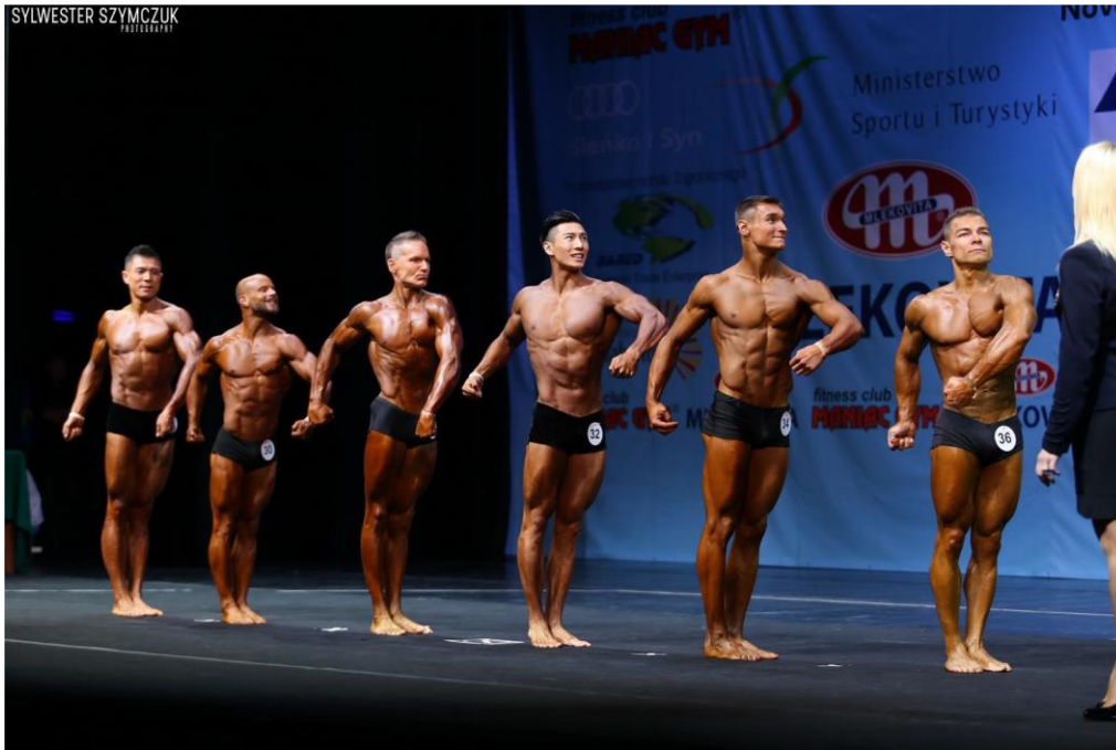
Bodybuilding VS Classic Bodybuilding VS Physique VS Fitness