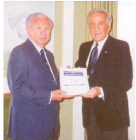
IFBB President Ben Weider proudly presenting the new IFBB Anti-Doping Program to then IOC President Juan Antonio Samaranch

All throughout this, President Weider had waged a determined and persistent battle for IOC recognition. Indeed, this fight occurred over the reigns of four IOC presidents: Avery Brundage (1952-1972), Lord Killanin (1972-1980), Juan Antonio Samaranch (1980-2001), and now, Jacques Rogge (2001-present). Recall that his first petition for IOC recognition was greeted by a legendary rejoinder from then IOC President Lord Killanin, " Sure ... over my dead body! " Luckily, IOC President Juan Antonio Samaranch was slightly more amenable towards the IFBB's efforts, stating in one letter to President Weider, " Mr. Weider ... you are a tenacious fighter for your sport. "