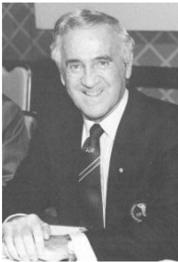
IFBB President Ben Weider at the 1986 IFBB International Congress in Tokyo, Japan

Dateline - Tokyo, Japan, Sunday, October 26th, 1986 ... history is in the making!