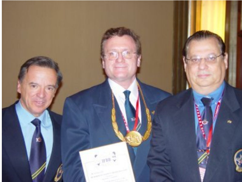
THE IFBB GOLD ORDER

Doping via the presentation of seminars, clinics and course programs worldwide.